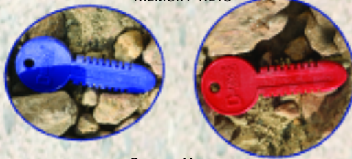
SERIAL MEMORY EXTENDED TOKENS