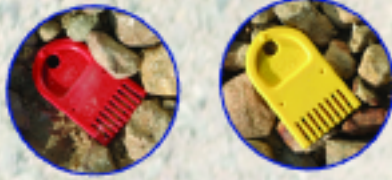
SERIAL MEMORY TOKENS