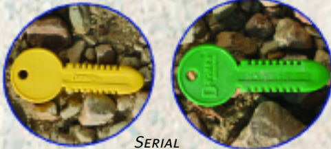
SERIAL MEMORY KEYS