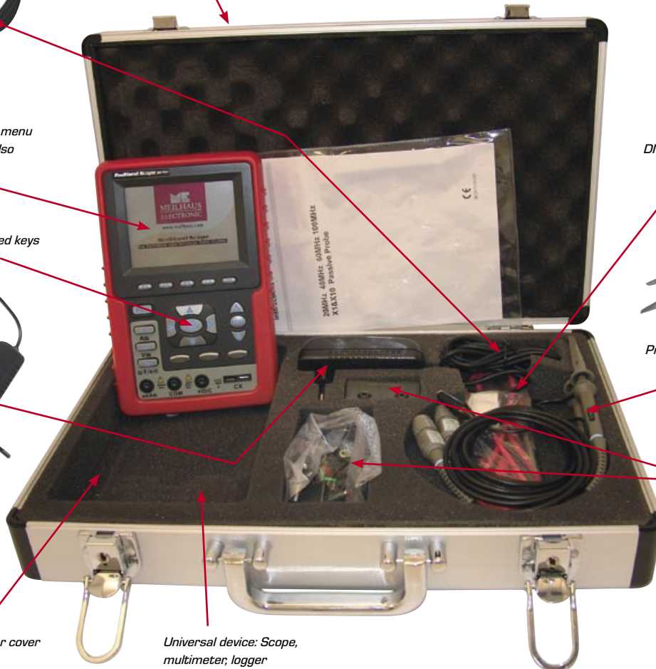
Universal device: Scope, multimeter, logger