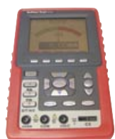
Housing with rubber cover offers a good grip