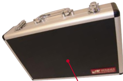
Lockable, robust, handy case

Handheld universal instrument, robust lockable case, instructions for use, CD with software, power adaptor (for loading the internal battery and for operation), 2 oscilloscope probes, 2 multimeter lines (black/red), adaptors etc.