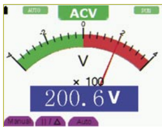
Screenshot of the RedHand Scope, multimeter mode