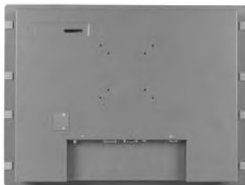
Various Mounting ways Panel/ Wall/ VESA