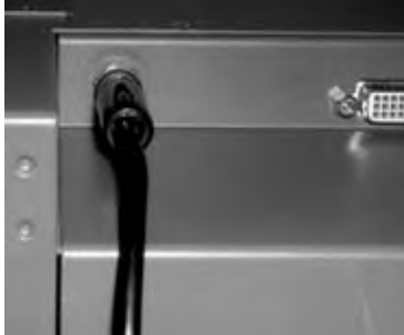
Screw-type Power Input