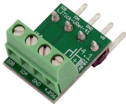
Figure 3: LJTick-VRef-41