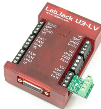
Figure 2: LJTick-VRef-25 with U3-LV