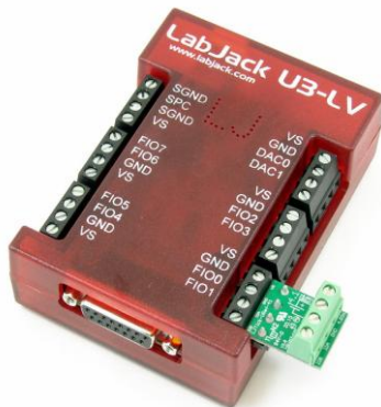
Figure 4: LJTick-VRef-41 with U3-LV